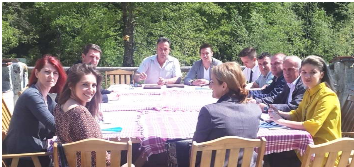
Photo while establishing the regional managing groups

coordinating group in cooperation with the municipalities will prepare the recommendations and carry the relevant decisions related to the PAV.