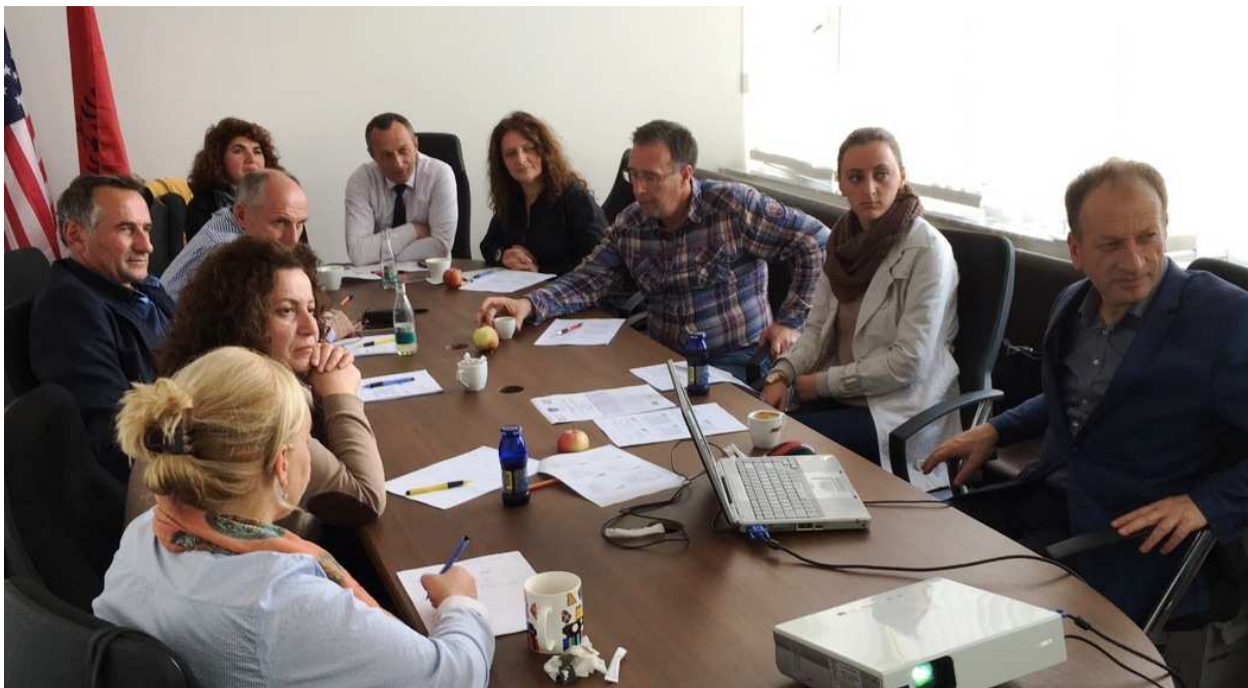
Photo from the trainings on capacity building of the agriculture sector

There were 100 participants that have undergone to these trainings (20 participants from each region).