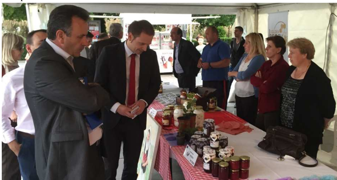
Photo during the Fair in Peja

In coordination with Regional Development Agency (RDA) West, in Peja Municipality was held the two-day fair (15-16.-5.2016) on promotion of the agro-tourism products, with a slogan “West Kosovo- a place to live, work, rest and invest”. The aim of this fair was to contribute in improving the image of the Western part of Kosovo, as a region known with a distinct tradition and culture. During the fair there were experiences exchanged among various businesses and local producers.