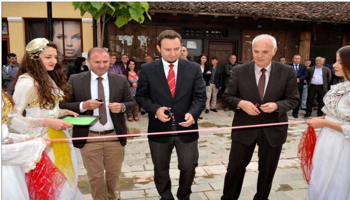
Photo from the official opening of the MFBC in Gjakova

The conference took place on the 28 th of May, 2015 in Gjakova. The participants of the conference were the representatives of the Office of European Union in Kosovo, RDA West, the representatives of six municipalities of the Region West, local NGOs, various businesses and media.