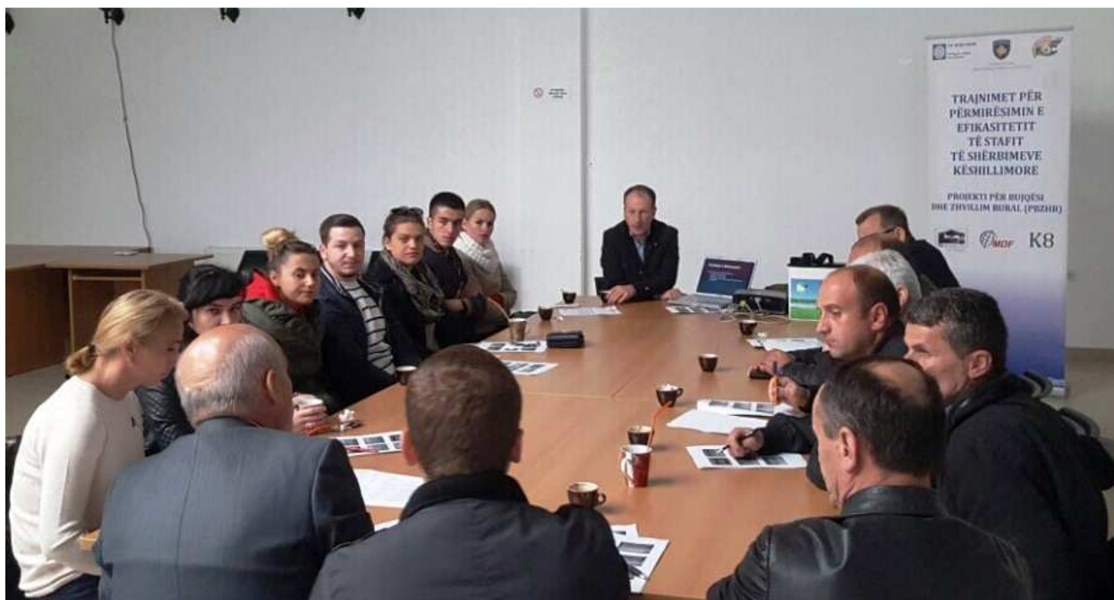
Photo from the training in capacity building of the agriculture sector

Most of the training had a multiple effect, since the trainees will have the chance to use the gained skills, knowledge and new perspectives on improving their work quality, communication with various actors and in contributing towards community development in general.