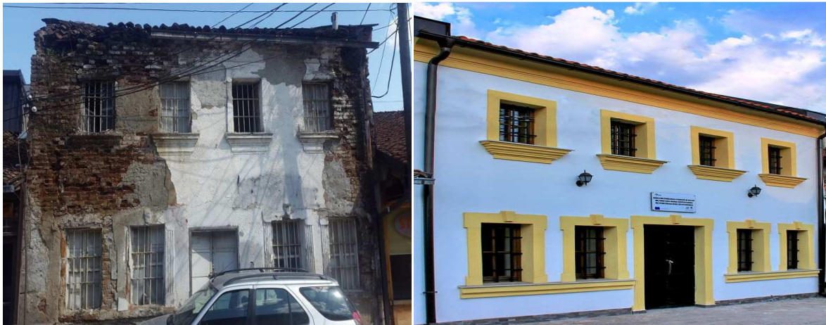
Photo during rehabilitation of the Multifunctional Business Center in Gjakova

The investment value of this building with a central heating as per EU standards was: 62,970.00 €.