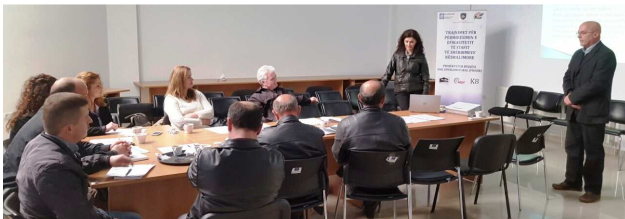
Photo from the training of Improving Writing Skills

The market requirements ask for continuous attention of the products' quality therefore, an inefficient and inappropriate management of post-harvest period, may lead to various barriers and mistrust by the farmers. The marketing may be defined as a series of activities that encounters the movement of a product from the production to the consuming point.