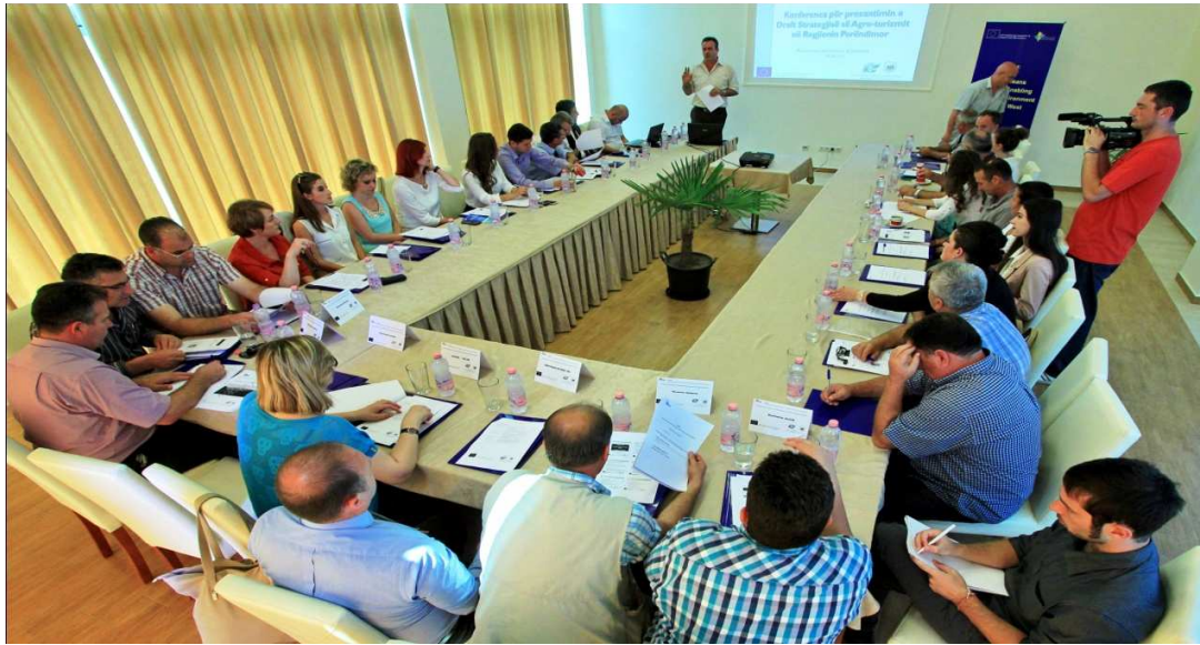
Photo from the conference for promoting the Agro-Tourism Strategy, Region West

Kosovo Development Center-KDC, within the project “West means business- enabling business environment in Region West” a project was financed by the EU and managed by the European Union Office in Kosovo, has organized the closing conference of the official opening of the Multifunctional Business Center in Gjakova.