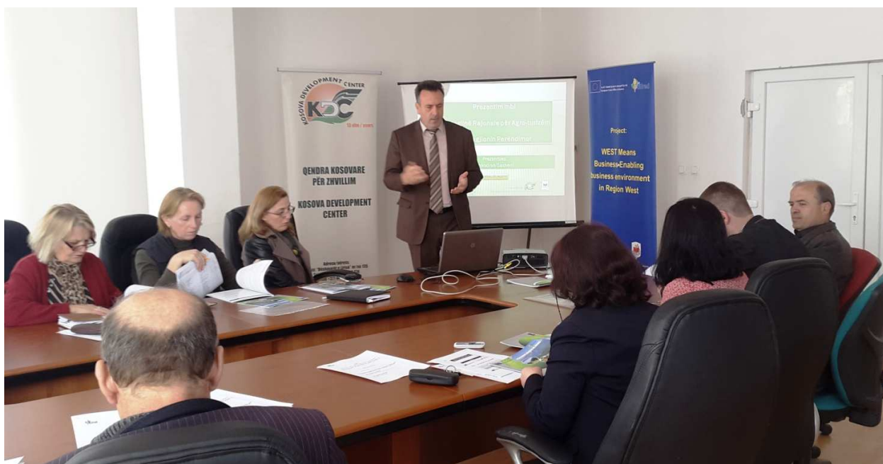
Photo during the workshop in Municipality of Klina on compiling the Action Plan 2015-2018