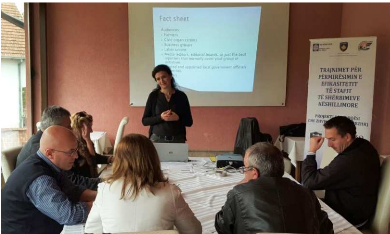
Photo from the training on developing Logical framework model in planning the extension services

The discussions made in these training sessions were also concerning the role of the facilitator on the adult learning, which are the techniques, which are the facilitation divergences and how is this achieved while making decisions in a group.